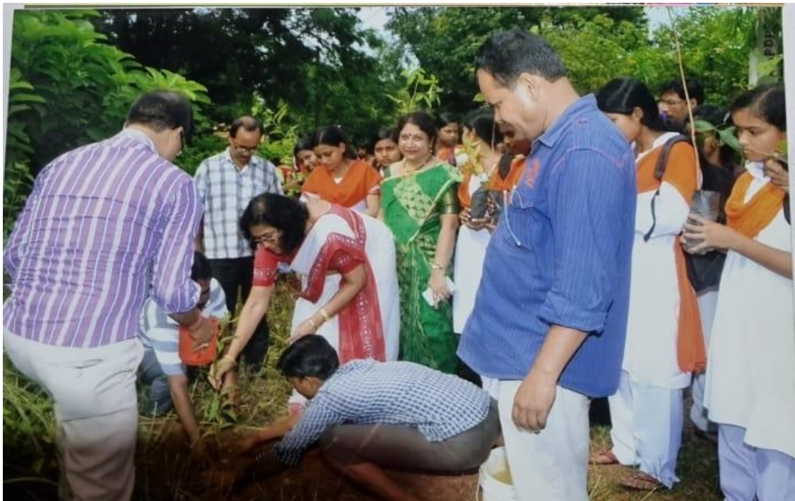
Fig: The Principal and office staff planting tree saplings.