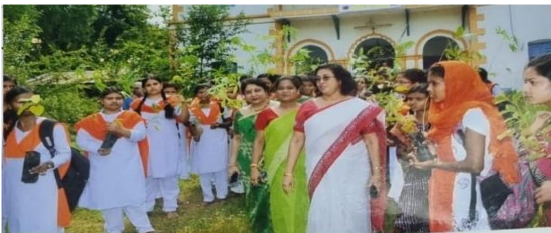
Fig: A grand procession of students, alumni members, teachers, and non-teaching staff, along with the Principal, participating in the tree plantation programme.