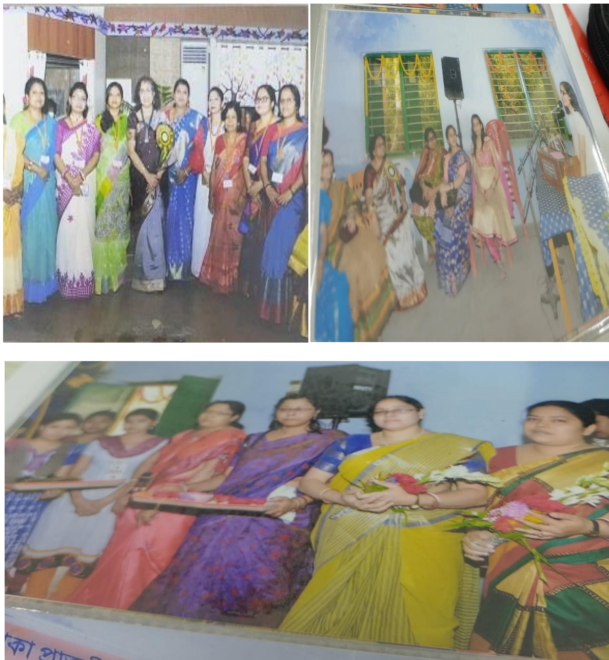
Fig: Reunion ceremony 2018-2019.