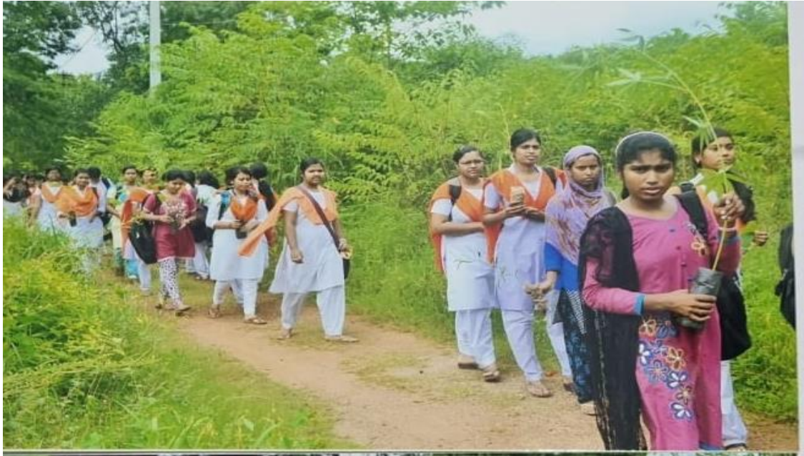
Fig: Students on their way to plant tree saplings inside the College campus.